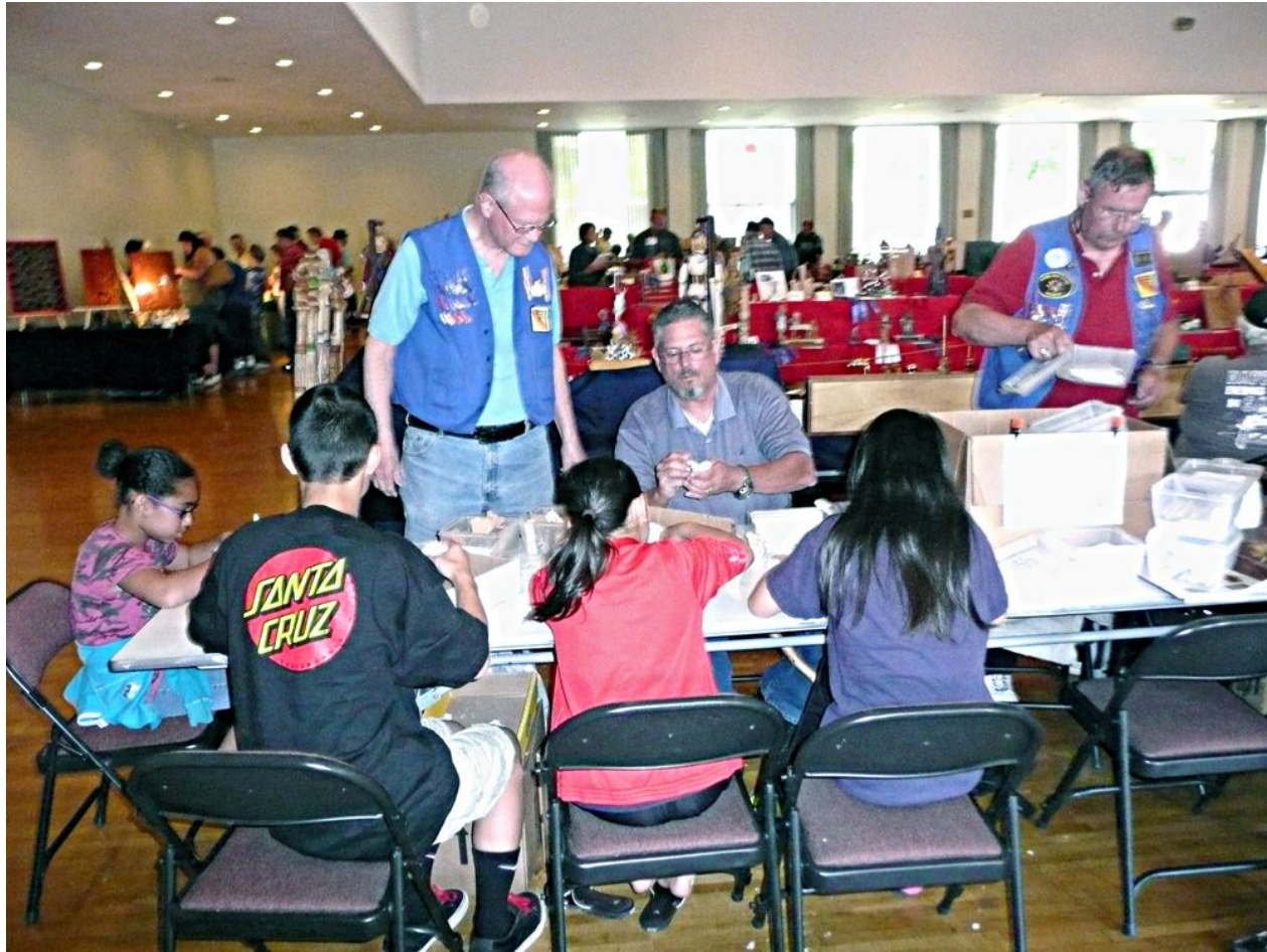
Soap carving demo at Sacramento Show