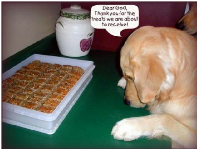
“Dear God, thank you for the treats we are about to receive!”

~~~~~ “Sometimes I’ve believed as many as six impossible things before breakfast.” ~Lewis Carroll (1832 – 1898), ‘Alice in Wonderland’~ ~~~~~